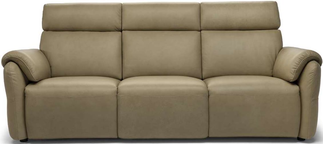
■ Vers. 155