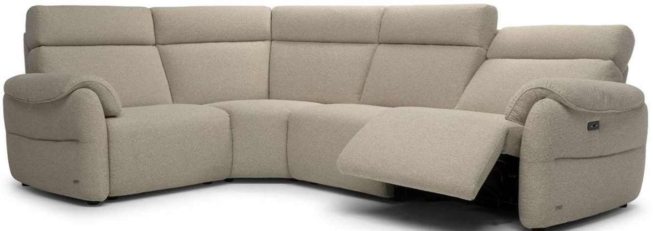
■ Vers. 272+076+291+F52