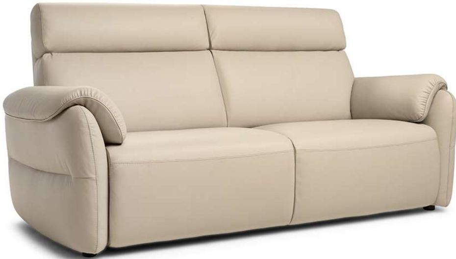
■ Vers. 009