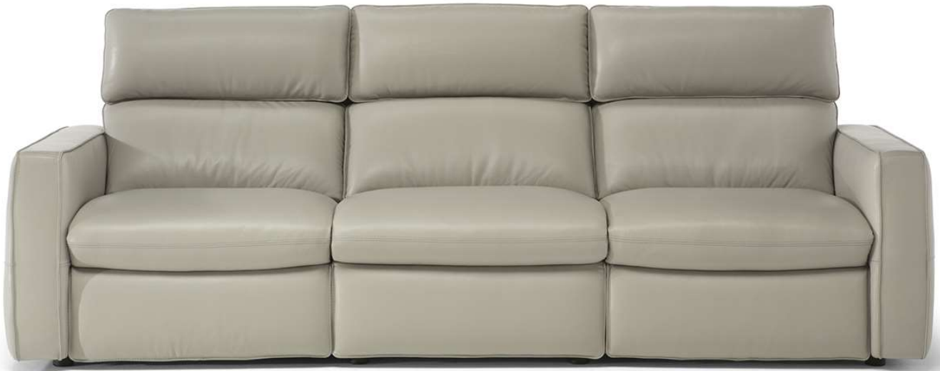
■ Vers. F50+291+F52