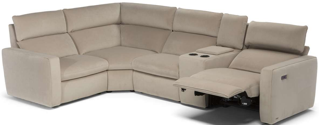
■ Vers. 272+011+291+323+F52