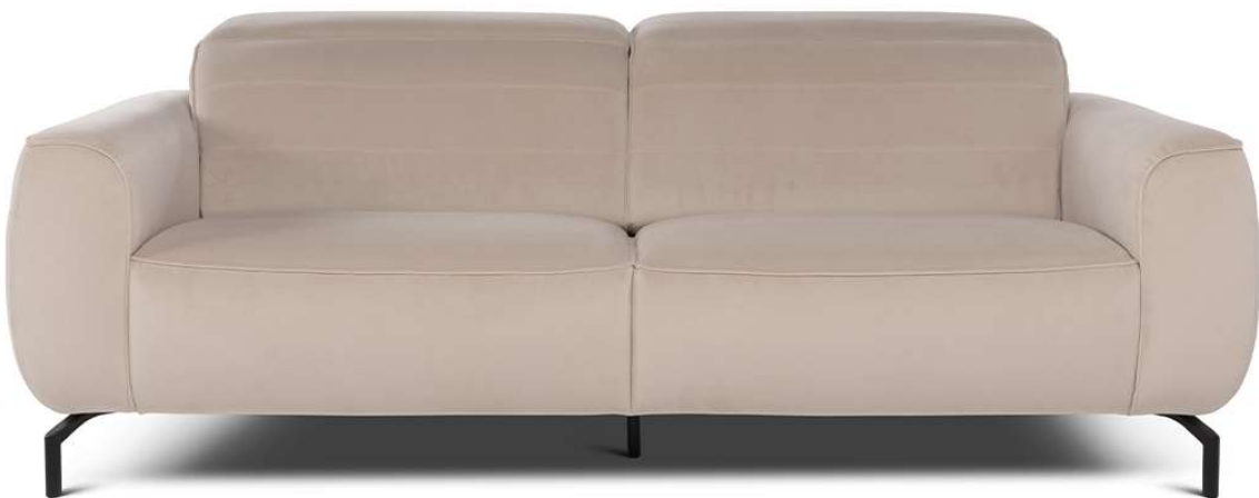
■ Vers. 009