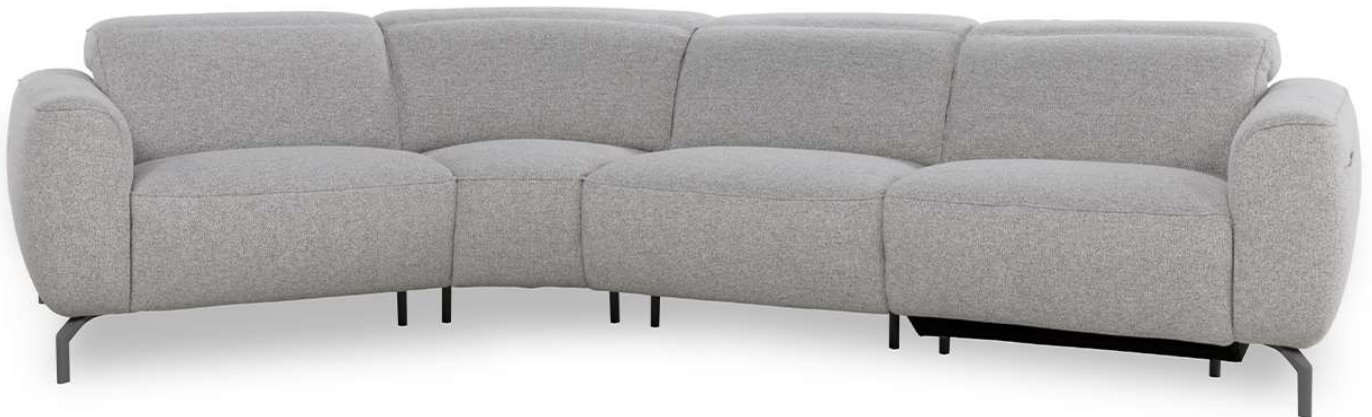
■ Vers. 272+045+291+F52