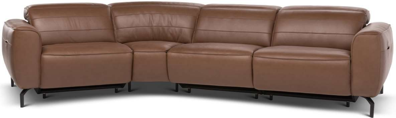
■ Vers. F50+045+F38+F52