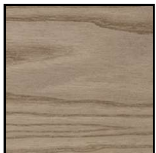
Ash Wood/Tobacco/Ch ampagne