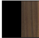
GLOSSY BLACK CHROME - EUCALIPTO WOOD