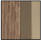
Glossy Champagne/Ash Wood Tobacco