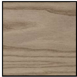
Ash Wood/Tobacco/Ch ampagne